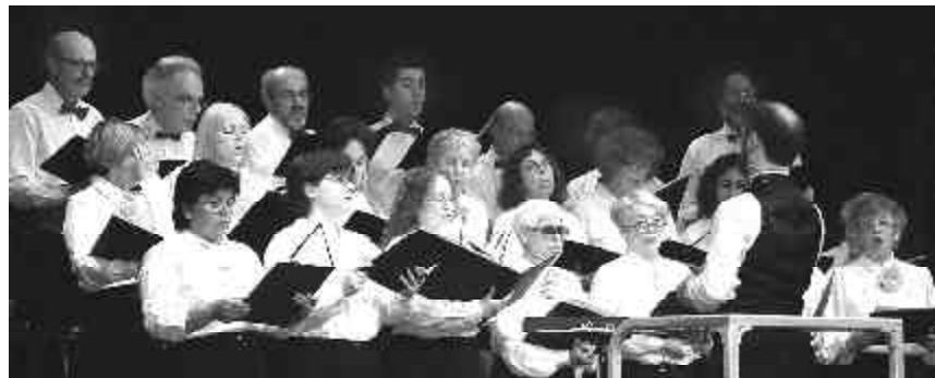
The Choir singing at the Community Third Seder

This year's program will feature songs from Yiddish Theatre and will also include Yiddish Tango, Chasidic Melodies, and other beautiful music in Yiddish, Hebrew, Ladino and English.