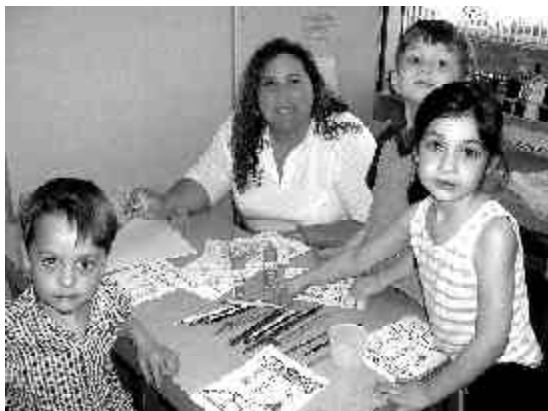
At Sunday School, 5 to 7 year olds learn about Jewish traditions through crafts, games, stories, songs and celebrations