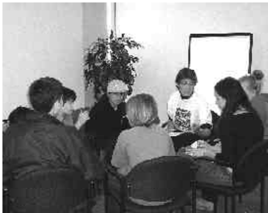
B'nai Mitzvah '04 teachers guide teams in preparing rebuttals during debate on the topic of survival of Jewish culture vs assimilation